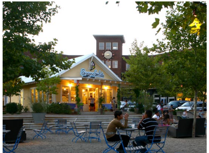
top left: Sketch plan for Town Center top right: Pedestrian-oriented retail bottom left: Town Center construction drawing bottom right: Community open space