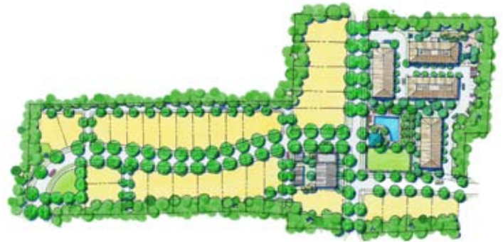
Design A is comprised of single-family based on R-4 zoning

TSW was retained by the Marietta Housing Authority to prepare four alternative site concept plans for the redevelopment of Lyman Homes. Each of the four site concept plans were developed using different zoning categories: Design A consists of single-family residential based on R-4 zoning; Design B is comprised of single-family residential and multifamily with a two or three story senior building; Design C consists of multifamily residential, which is a combination of townhomes and condominiums; and Design D is single-family that maximizes open space and creates a desirable pedestrian scale.