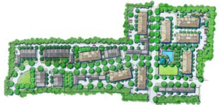
Design C consists of townhomes and condominiums