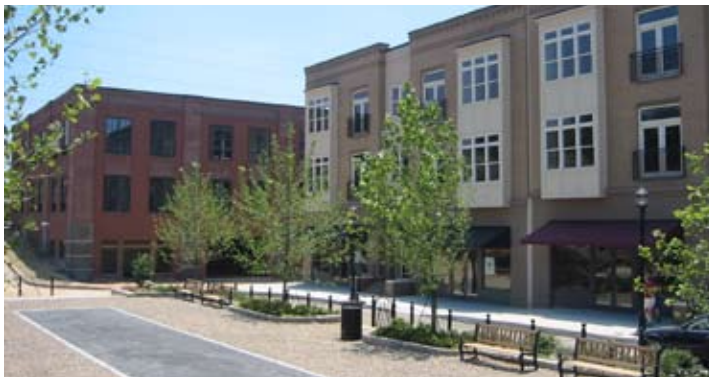
below: West Bartram Townhomes