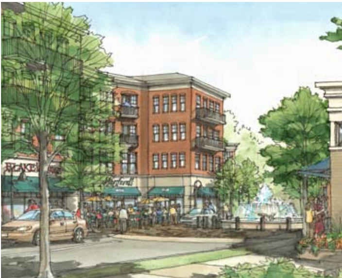
right: Concept Master Plan bottom left: Main Street terminates with the community fountain bottom right: Sidewalk retail found along Main Street

Centennial Walk offers the best of both worlds: the warm charm of a neighborhood community with the urban convenience of walkable destinations.