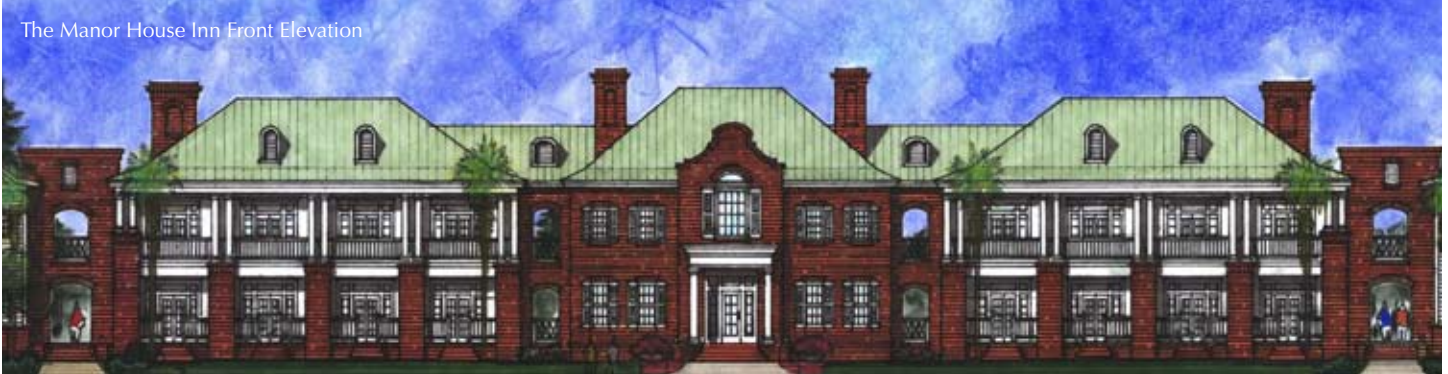
The Manor House Inn Front Elevation