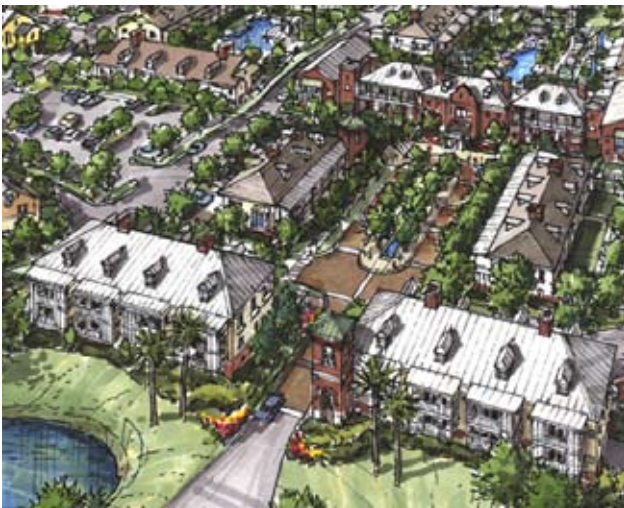
Litchfield Main Square

Litchfield Reunion is a four phase resort community planned for Pawley's Island, South Carolina for the Litchfield Company. Architectural pieces designed by TSW consist of a Town Square, with retail and amenities, the Manor House Inn, cottages, villas, courtyard houses, and other second-home product offerings.