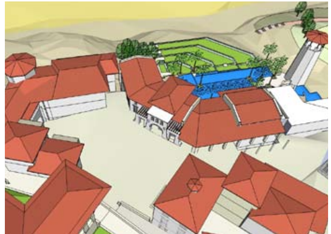
Aerial of Beach Club and Inn

The multi-level terraced plan responds to the site's challenging topography by providing direct outdoor access to all inn rooms, each of which has a different floor plan, while requiring only a single elevator. The architectural design of the inn, a fusion of Mediterranean and tropical influences, integrates the inn's hillside buildings seamlessly into the fabric of the town.