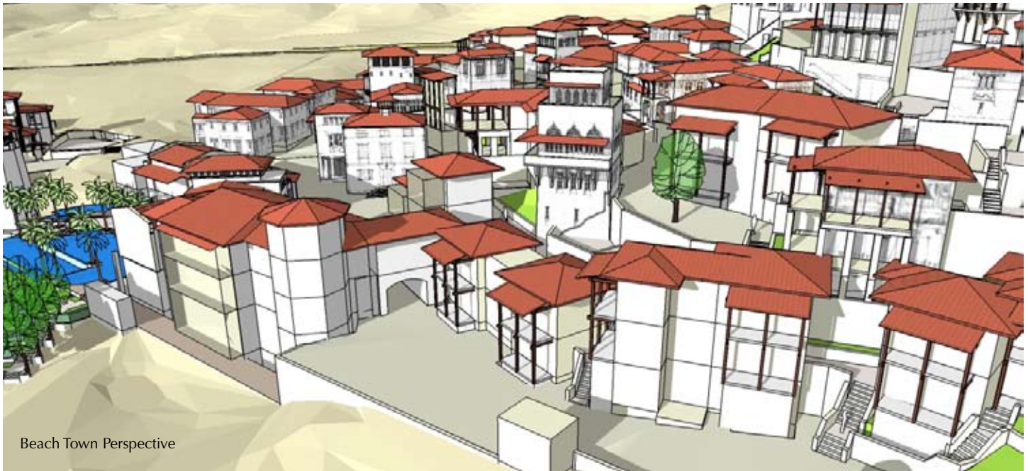
Beach Town Perspective

Las Catalinas is a new town of some 3,000 homes, currently under construction in Guanacaste, Costa Rica, modeled on European hill town precedents and designed based on New Urbanist principles to minimize dependence on cars. In conjunction with TSW's master planning role for Las Catalinas, our architecture studio is collaborating on the design of a boutique 18-room Oceanside inn and adjoining beach club, which together will anchor the first phase of development.