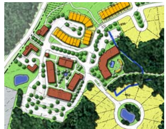
Illustrative Masterplan for: La Gardéna by: Tunnell-Spangler-Walsh & Associates