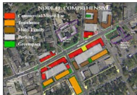
top: Land Use Changes Recommendations middle: Commercial Activity Nodes Map bottom left: Community workshop bottom right: Concept plan of activity node along Wynnton Road