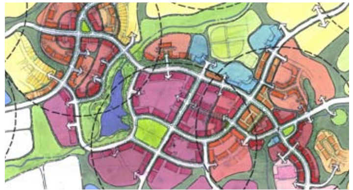
top right: Land Suitability Analysis middle right: Detailed Land Use Plan for Town Center bottom: Development Framework Plan showing 1/4-mile radius activity nodes