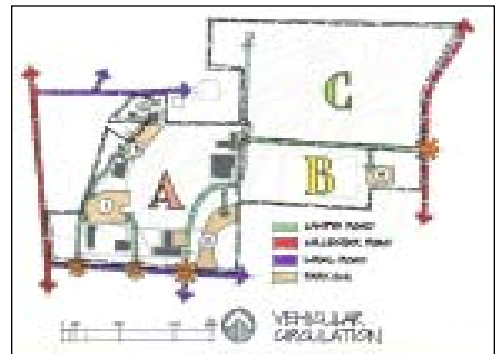
Analysis chart for Dyersburg State Community College (TSW).

TSW was retained in 2002 by DSCC to update a master plan for the 110-acre main Dyersburg State Community College campus. The update incorporates changes that had occurred since the last plan (1991) and strongly supports the need for facility expansion while retaining the existing campus' scenic character. The plan was further revised when a significantly higher than expected student enrollment occurred in Fall 2003 and 2004.