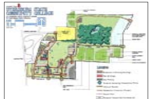
One of three concept plans for DSCC.