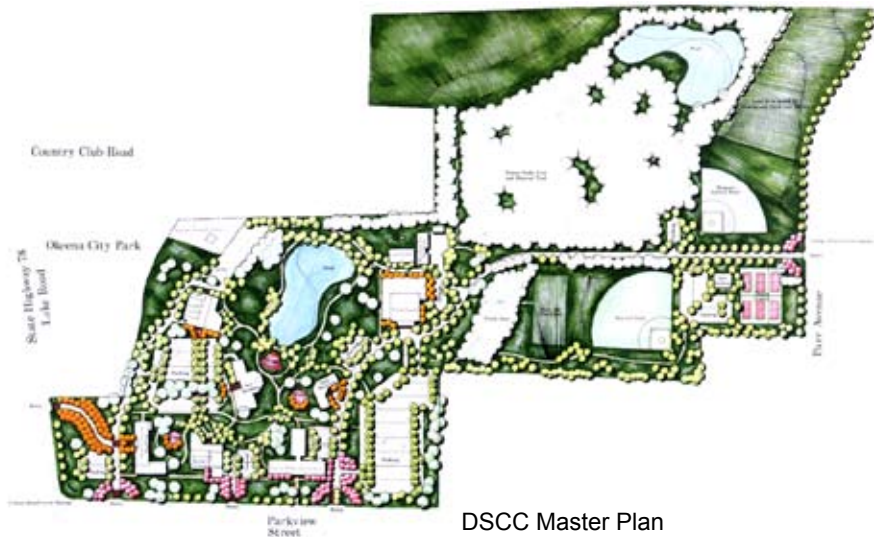
DSCC Master Plan