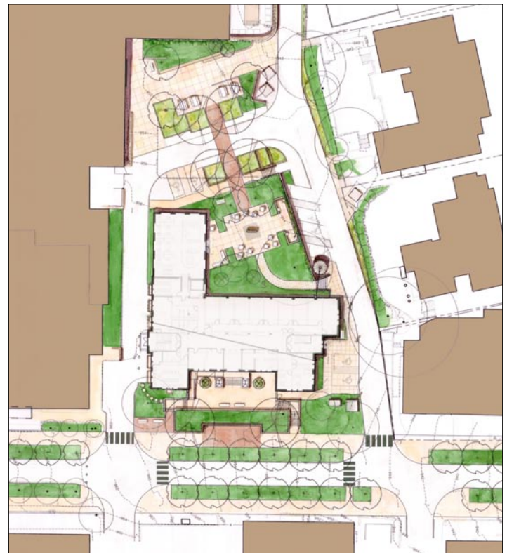
top: Character renderings of Old CE Building Courtyard left: Section of front of Old CE Building above: Phase I Master Plan

The final product, as part of the construction document phase, included plans for hardscape, planting, irrigation, site furnishing, electrical, and detailed site grading.